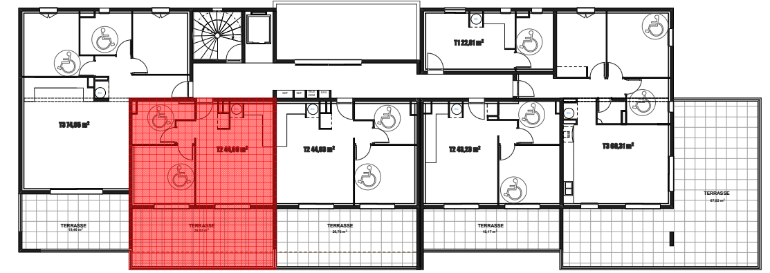
Plan d'étage courant R+1