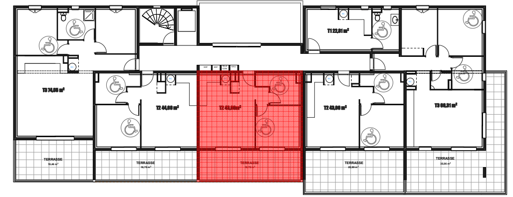
Plan d'étage courant R+2